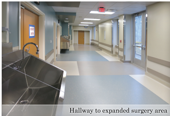
Hallway to expanded surgery area