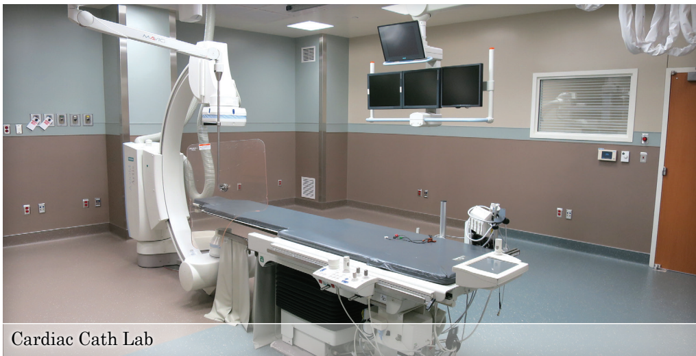
Cardiac Cath Lab

As part of the Methodist surgery renovation and expansion project, the first of two new cath labs has been completed. The second one will open in March.