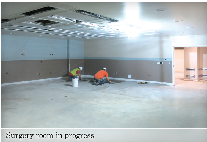
Surgery room in progress

This fall another important milestone will be achieved: 15 brand new operating rooms will be completed. These state-of-the-art rooms will strengthen Methodist's reputation as the regional leader in surgeries.